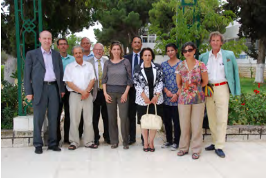
ASIIN auditors and Tunisian project partners

As you have read in our previous newsletters, the German accreditation agency ASIIN was chosen to verify and certify our master programme innovation management. After the training with ASIIN experts in September 2013 and the four accreditation workshops from November 2013 to January 2014 the final version of the accreditation application was finished and submitted to ASIIN in March 2014. In June a two days on-site accreditation visit was organized to evaluate the environment, students and teachers of the master programme that needs to be accredited. The accreditation team consisted of four external German auditors and one representative from ASIIN who attended the visit in Tunis. Based on a given agenda, the auditors