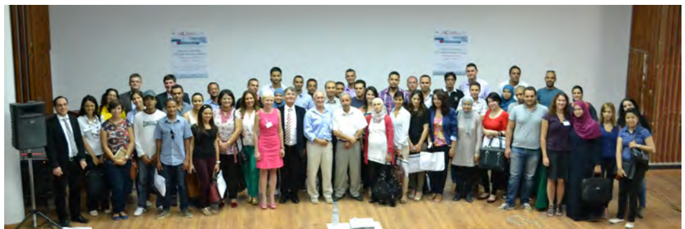
Summer School 2013

Our project DICAMP is coming to an end on October 14th. Therefore we are currently preparing a final event and project workshop in Tunis, especially to raise the awareness for our master programme again in Tunisia particularly among the industry and to finalize the sustainability strategy. The final event will include a summer school with open lectures where first cohort students will teach the new generations about diverse innovation topics. Furthermore a graduation ceremony of the first cohort of students will be organized as well as an innovation conference supported by APII and companies (HP, PWC, Orange) who will give awards for the best master thesis. We are planning to finish our summer school with an innovation workshop in a company in Tunis and a joint social farewell event with the Tunisian students and teachers. Regarding the DICAMP project a last workshop will be conducted where the final report and finances will be discussed among all project partners.