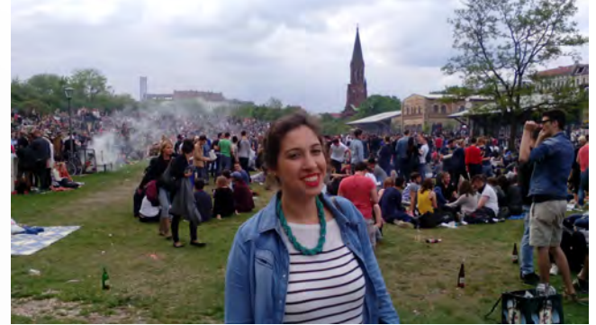
Aida in X-berg, Labor day

area of Kreuzberg that has been transformed into a giant open-air musical scene. So crowded that bike could hardly pass! It amazed me because first we don't celebrate Labor Day in Tunisia that much and second because it is interesting to see how it is done in Germany, a country that values labor and owes its development and success to the hard-work and collective sweat of its people.