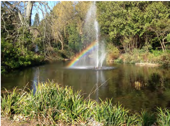
An impression from the campus in Exeter

Imen: I visited London - a pool of historical monuments! It is an amazing city. Three days were not enough to discover it well. But I went to the Buckingham palace, the Big Ben, the Tower Bridge, and Mme Tussauds.